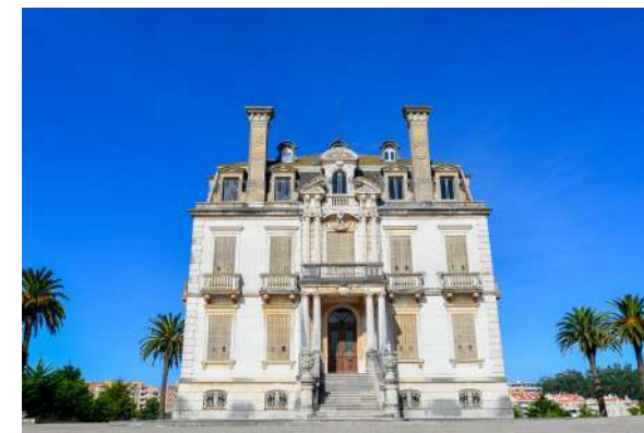
Palácio de Sotto Maior, Figueira da Foz