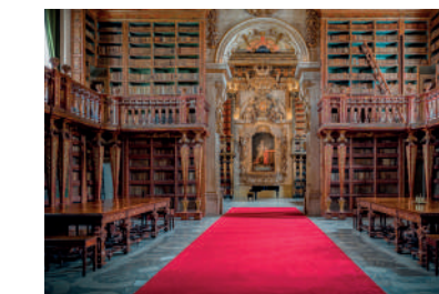
Biblioteca Joanina, Coimbra 43 min