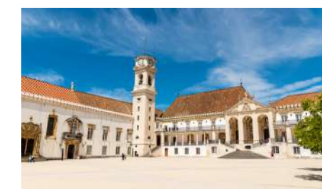
Universidade de Coimbra 40 min