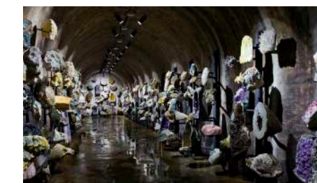
Aliança Underground Museum, Anadia 55 min