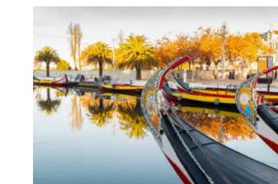
Aveiro 52 min