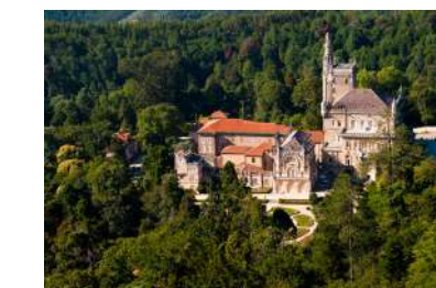
Palácio do Bussaco, Luso 1h 2min