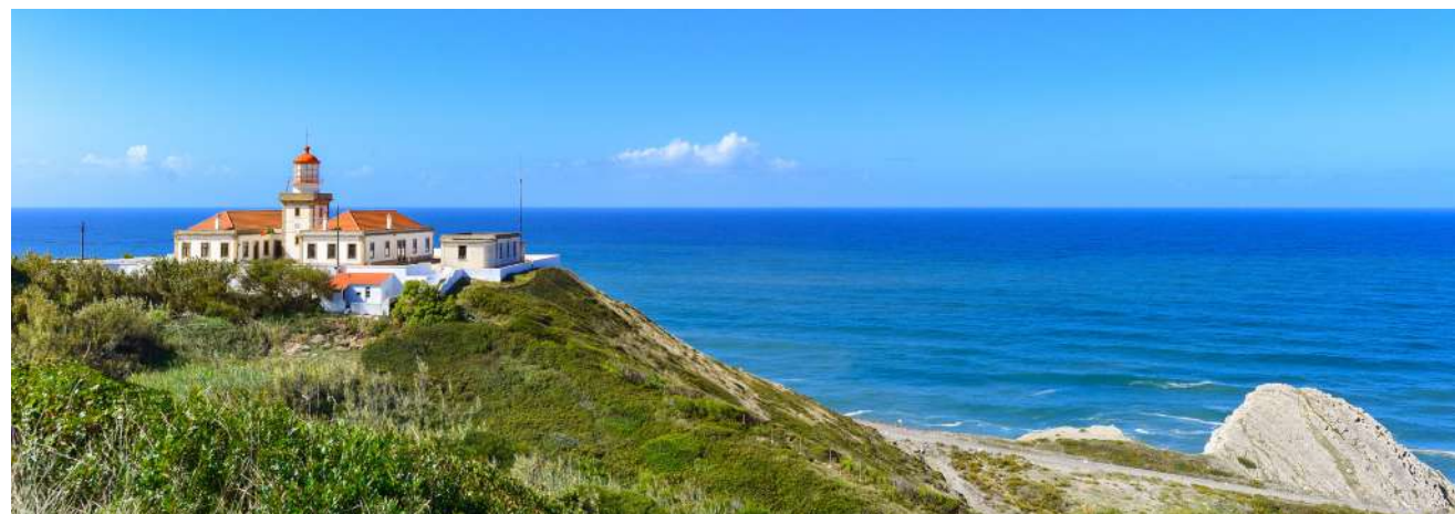
Serra da Boa Viagem, Figueira da Foz