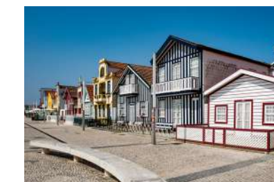
Praia da Costa Nova, Ílhavo 56 min