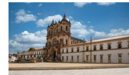
Mosteiro de Alcobaça 55 min