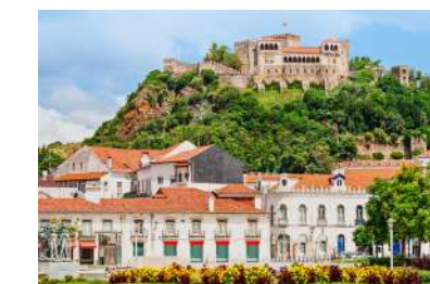
Castelo de Leiria 44 min