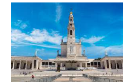
Santuário de Fátima 57 min