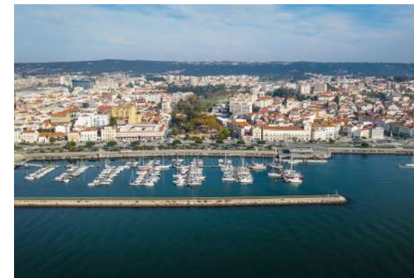
Marina da Figueira da Foz

Nature, culture, historical and religious sites, gastronomy, wines and charming people await you.