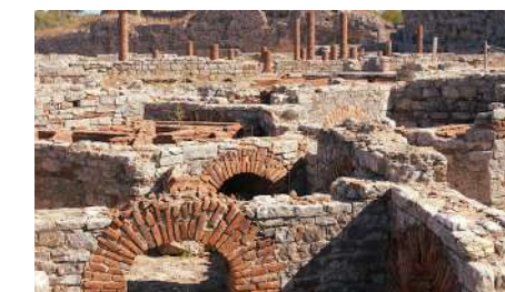
Ruínas de Conimbriga, Condeixa 44 min