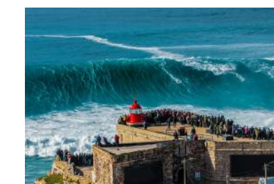
Praia Norte, Nazaré 1h 2min