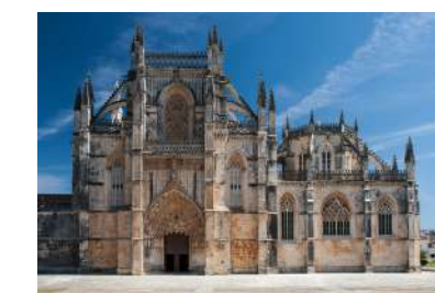
Mosteiro da Batalha 52 min